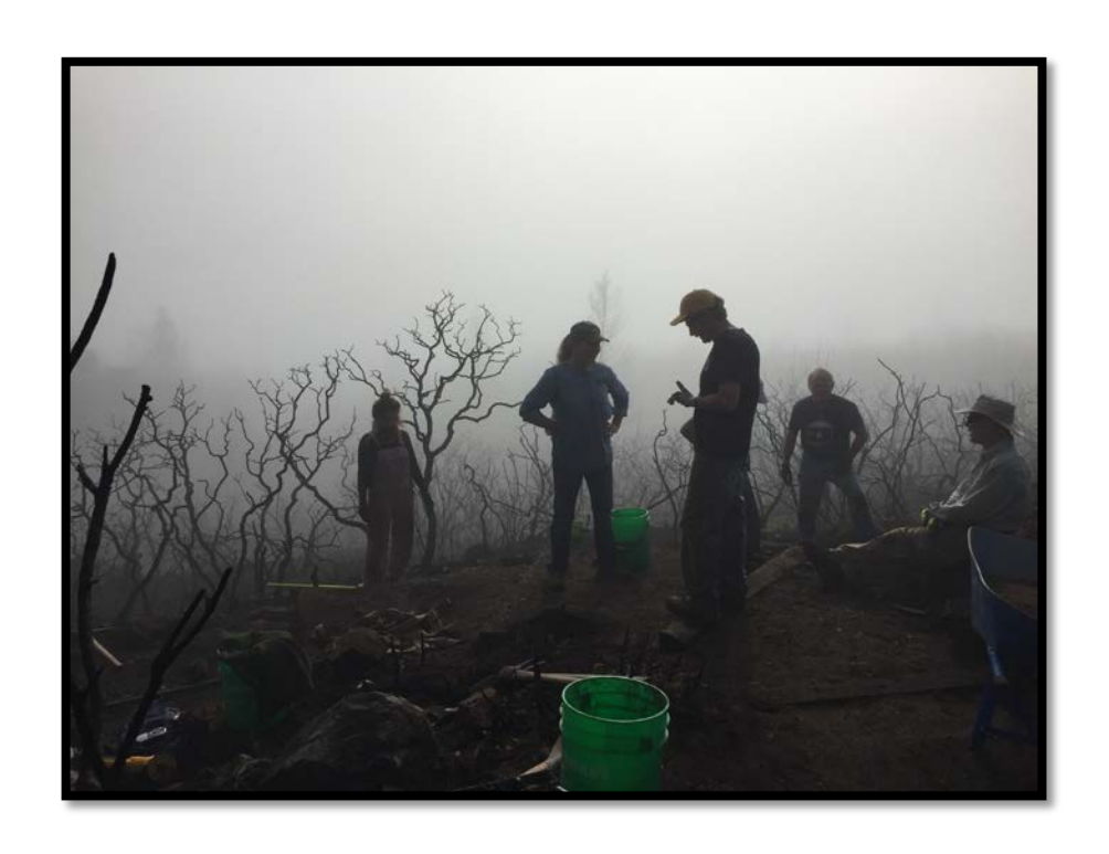
Presented by Sonoma Ecology Center Sugarloaf Ridge State Park 2605 Adobe Canyon Rd., Kenwood, CA 95452 www.sugarloafpark.org